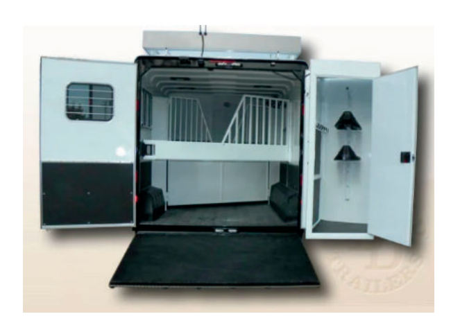
SafeTack Trailer Design

You can train your horse to load calmly and confidently, but something unexpected could happen at any moment. And sometimes, your trailer is hurting rather than helping. Read on to learn how Double D Trailers used an accident as a catalyst to improve their product